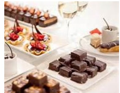
Mouth Watering Desserts—Zero Calories