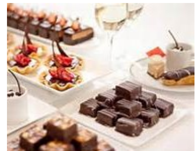
Mouth Watering Desserts—Zero Calories